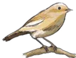
C H I F F C H A F