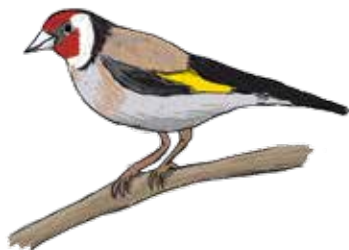
G O L D F I N C H

Who else flies with me in Trauttmansdorff's downy oak forest?