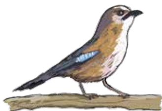
E R A S I A N J A Y